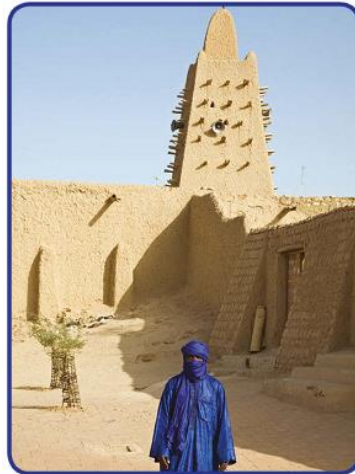
Source 2: Platinum Grade 7 Social Sciences Learner's Book, page 107